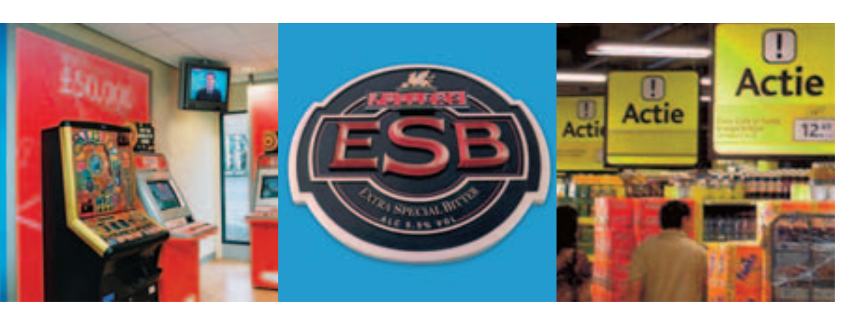
Shop fitting, interior design FOREX®classic